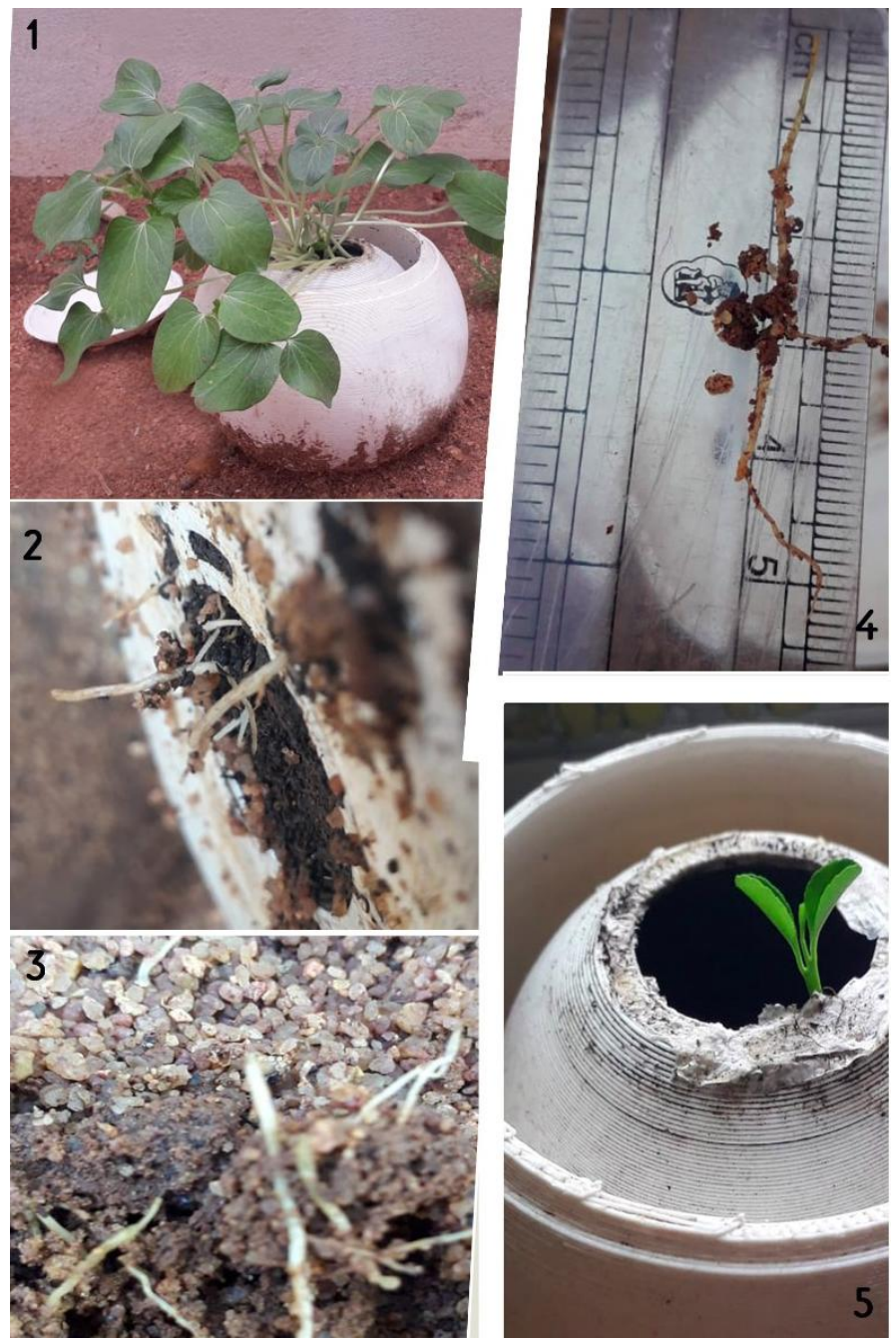
Figure.1 Robust growth of ladies finger seeds in seed wombs, Fig.2-Serrated roots emerging out of seed womb and piercing the soil Fig.3&4-The cluster of roots in the soil and length of the roots in the soil Fig5-Growth of hardy tamarind seeds in seed wombs. Duration -20 days

Where rates of tropical deforestation are high and where formerly forested landscapes are converted into mosaics of small patches of forest remnants, forest restoration has become an increasingly important tool for species preservation and for maintaining the diversity